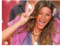
Superstars shining at 62nd Golden Globe Awards